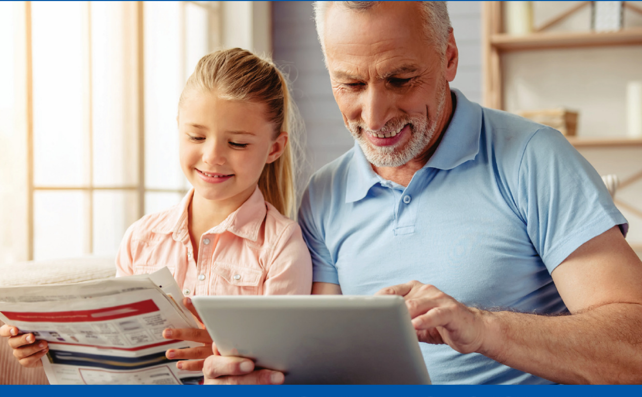
Protect your devices with ORBITEL PROTECTION PLAN!