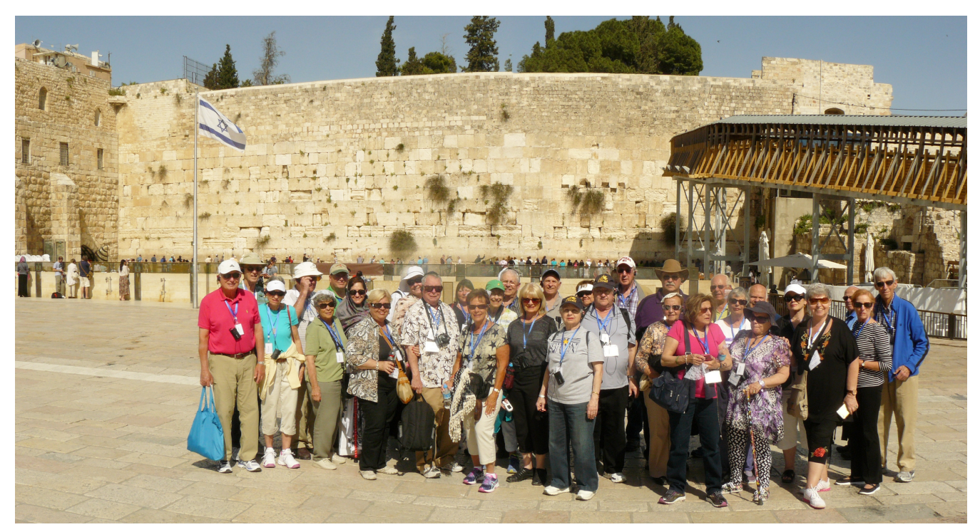
The SLJC Mission to Israel: Plaza in Front of the Western Wall

Note: Donations to Jewish Free Loan up to $200 per person entitle each donor to an AZ state tax credit (dollar for dollar)!