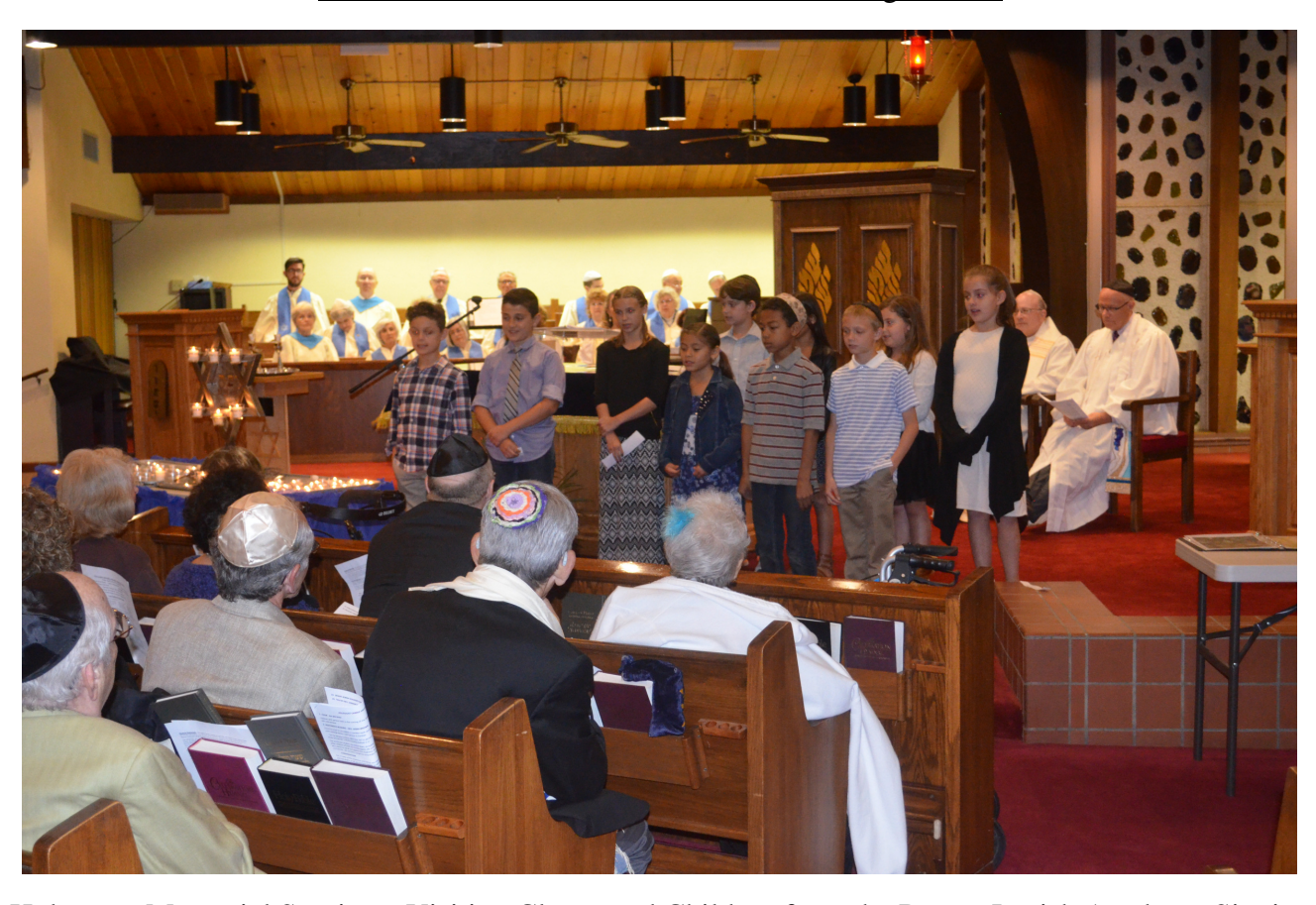
Holocaust Memorial Service – Visiting Clergy and Children from the Desert Jewish Academy Singing