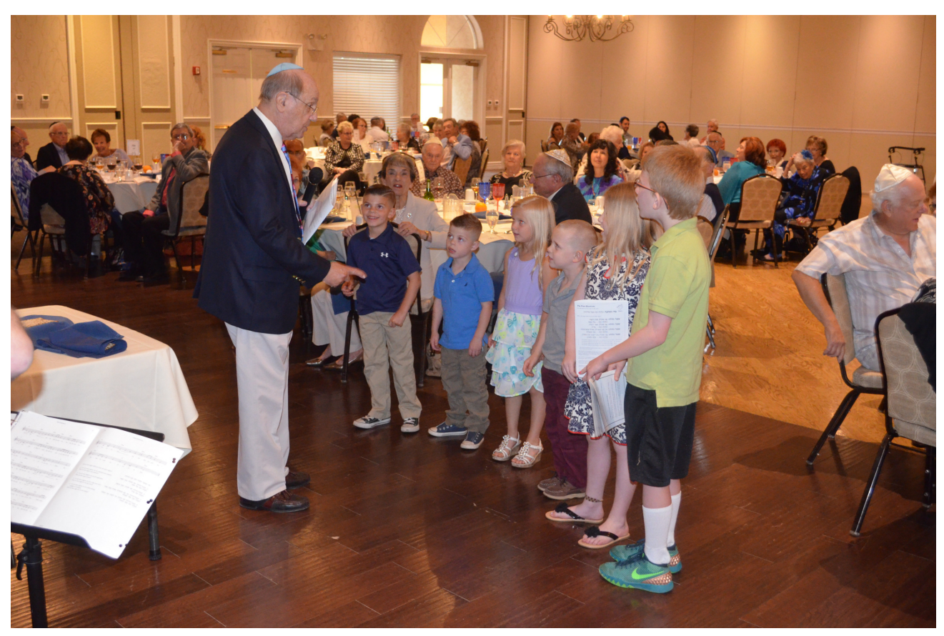
<u>Instructions for Afikomen Hunt at the 2<sup>nd</sup> Night Seder</u>