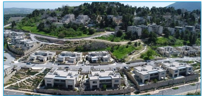
Kibbutz Sasa, Now