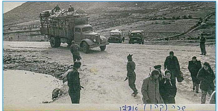
Laying Pipelines, Kibbutz Sasa 1949